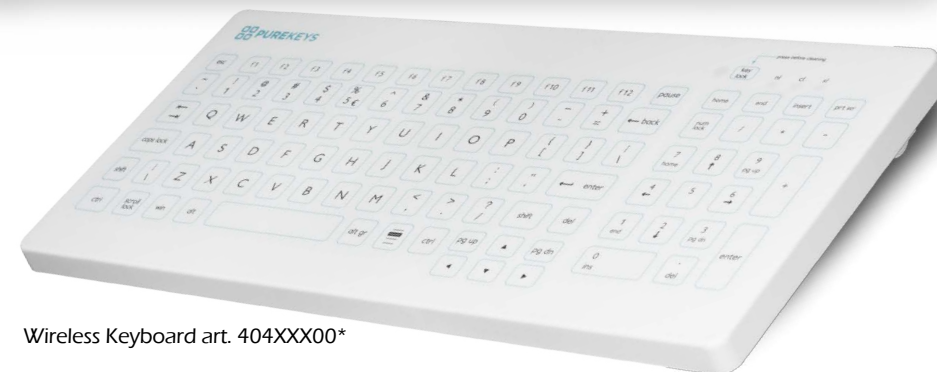
Wireless Keyboard art. 404XXX00*

*XXX=Country code for layout. Available in following layouts: US-Int, Nordic, UK, German, French, Spanish, Italian, Belgium, Swiss Other countries and customized layouts available upon request.