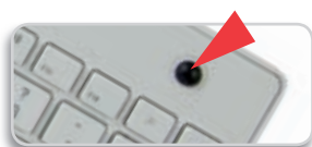
8 mm Laser trackball